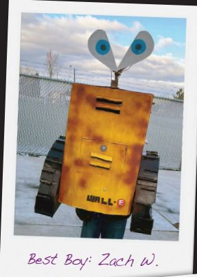
Best Boy: Zach W.