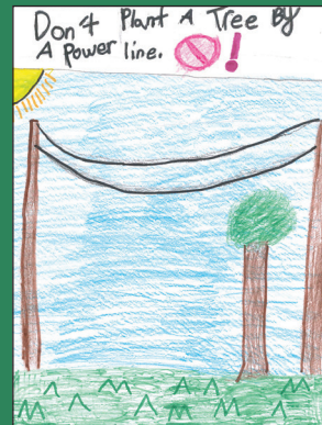
Second place, ages 8-12 Peyton K.