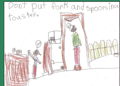
Second place, ages 5-7: Kira W.