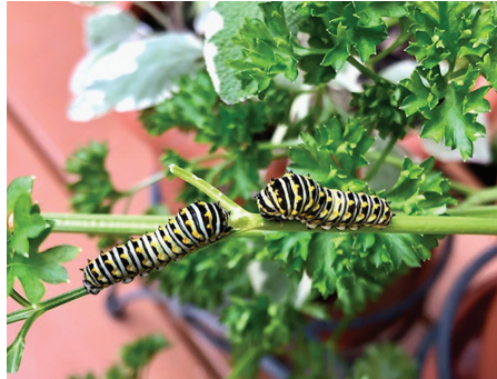
First Place – Pat Nehring of Hayward Parsley-Snacking Black Swallowtail Caterpillars

It was not an easy task picking the top three photo contest winners as each participant sent pictures that truly displayed the beauty that is all around us. You will find these and other submitted photos within the 2024 co-op calendar that will be available at each office at the end of the year. Be sure to stop at the office in December and pick one up.