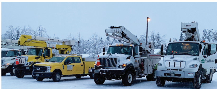
Crews from six neighboring electric cooperatives assisted with power restoration.

If you do not already have a storm safety kit, we encourage you to put one together. You can find a list of what should be included within this kit at jrec.com/electrical-safety-information . Be sure to let your utility know if you purchase a generator that you plan to connect to an electric panel. Improperly installed generators can create back feed, which is dangerous to their crews and the community. You should never operate a generator indoors or in an enclosed space.